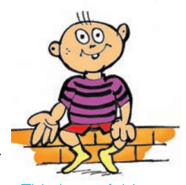
This is not fair! What was the point in having a Constituent Assembly in India if all the basics were already decided?

All countries that have constitutions are not necessarily democratic. But all countries that are democratic will have constitutions. After the War of Independence against Great Britain, the Americans gave themselves a constitution. After the Revolution, the French people approved a democratic constitution. Since then it has become a practice in all democracies to have a written constitution.